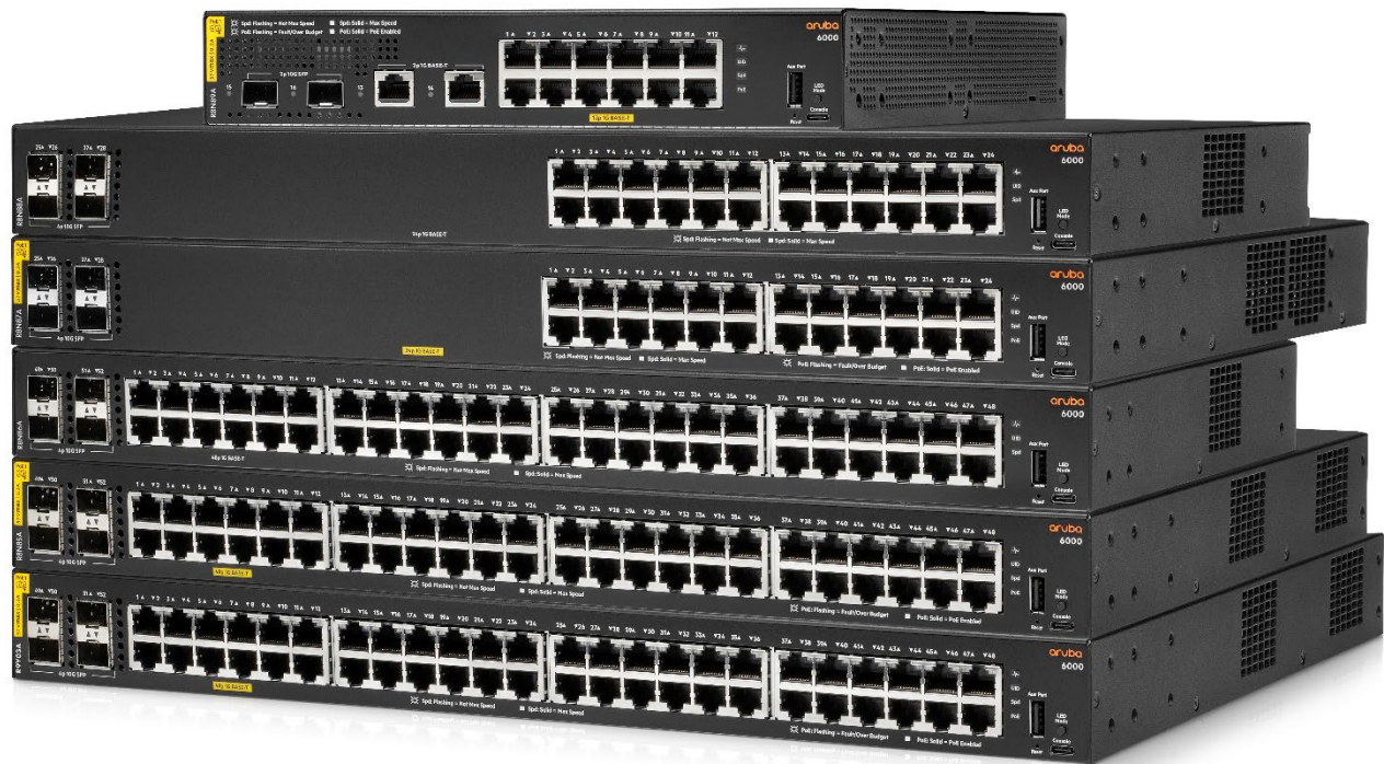
HPE Aruba Networking CX 6000 Switch Series

The HPE Aruba Networking CX 6000 Switch Series is easy to deploy and use with flexible management choices that include Web GUI, CLI, cloud based and on-premises Aruba Central management, so you can choose the best fit for your business and network environment. Delivering Layer 2 capabilities with enhanced access security, traffic prioritization, and Ipv6 support, the CX 6000 also simplifies ownership and brings peace of mind with switch software embedded with no subscription required to enable and a Limited Lifetime Warranty.